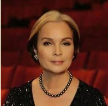
MARIA MARGARITA MORAN-FLOIRENDO Vice Chairperson